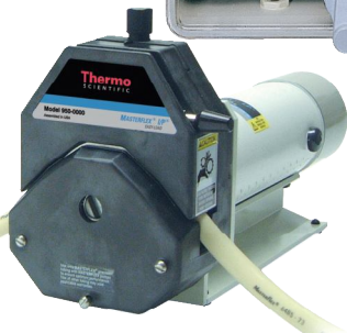
Washdown Modular System 950-1010 includes an EASY-LOAD® pump head