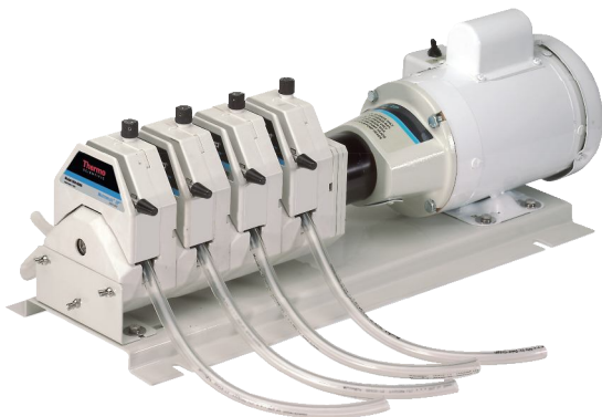
Four-channel washdown pump 950-3614 includes four Easy-Load® pump heads