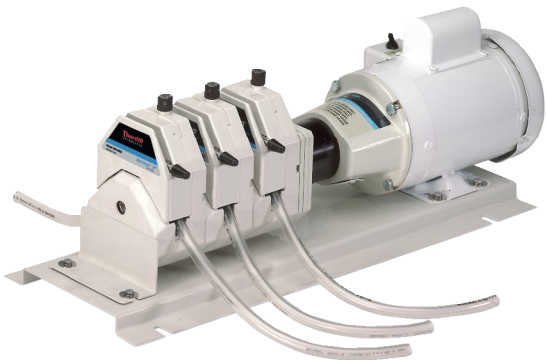
Three-channel washdown pump 950-3613 includes three Easy-Load® pump heads