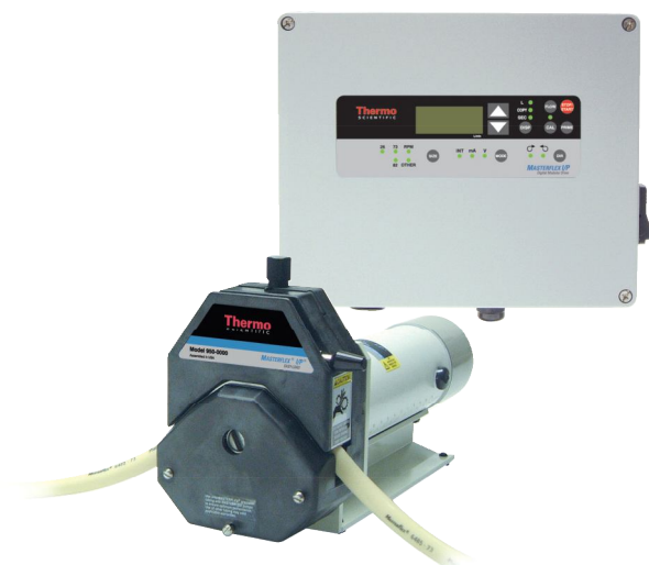
Metering System 950-2010 includes an EASY-LOAD® pump head