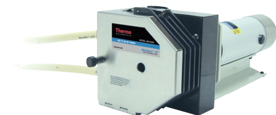
Metering System 960-2010 includes a High Performance pump head