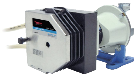
Air-Powered Pump 960-1020 includes a High-Performance pump head