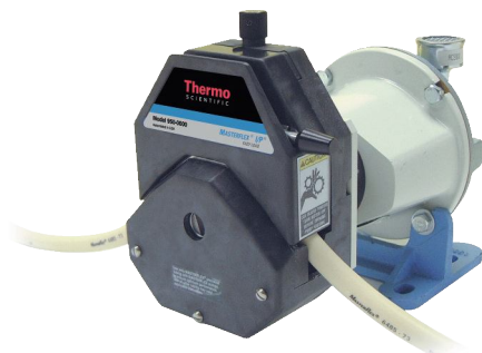
Air-Powered Drive 950-1020 includes an EASY-LOAD® pump head

No electric power required— use where electricity is unsafe or impractical.