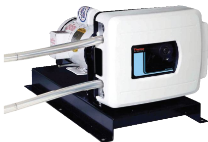
B/T Fixed-Speed Pump System 945-1625