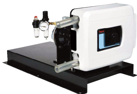
B/T Air-Powered Pump System 945-1620